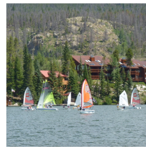
Grand Lake, Colorado