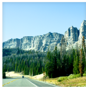
The Grand Tetons